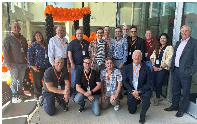
Some attendees at the inaugural 2024 fall conference of UTDSI SNR take a break to enjoy the festivities of 'AgDay' at UT