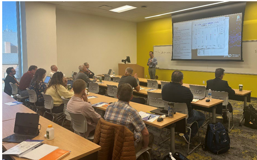
Attendees of the 'Software Applications in Data Analytics' workshop at the 2024 fall conference at UT.